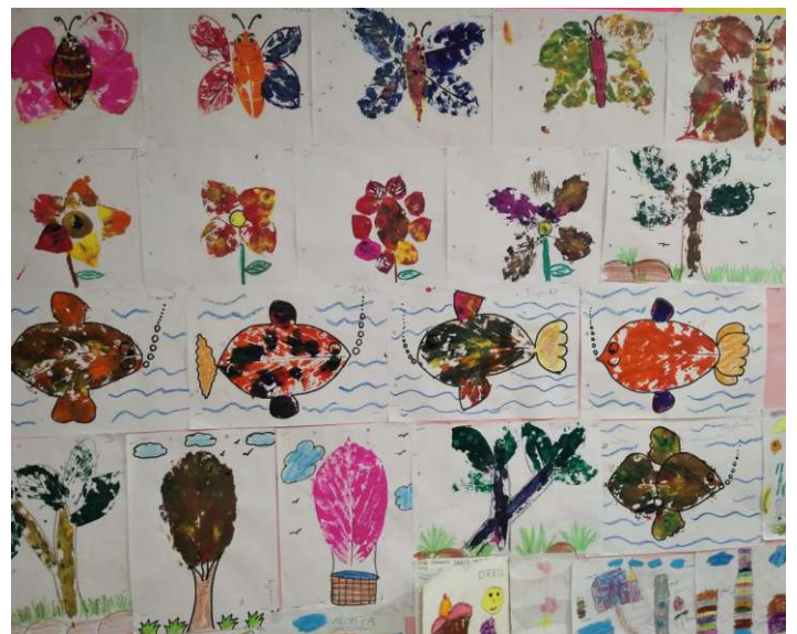
WE MADE SHAPES WITH LEAF PRINTING