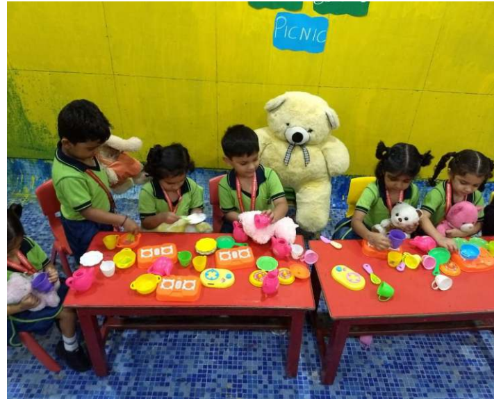
COOKING FOR MY FAVOURITE TEDDY