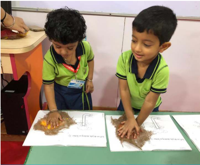
LET'S STICK JUTE ON LETTER J