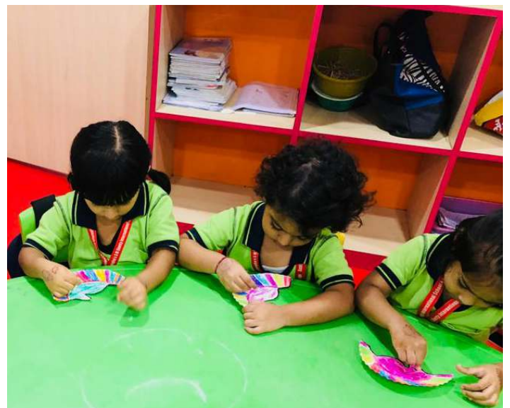
MY SEAHORSE IS THE PRETTIEST