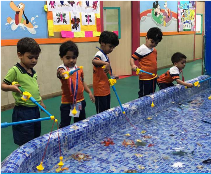
CATCHING FISH IS TIRING