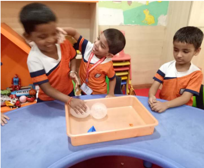
FROZEN BALLOONS ARE SO MUCH FUN