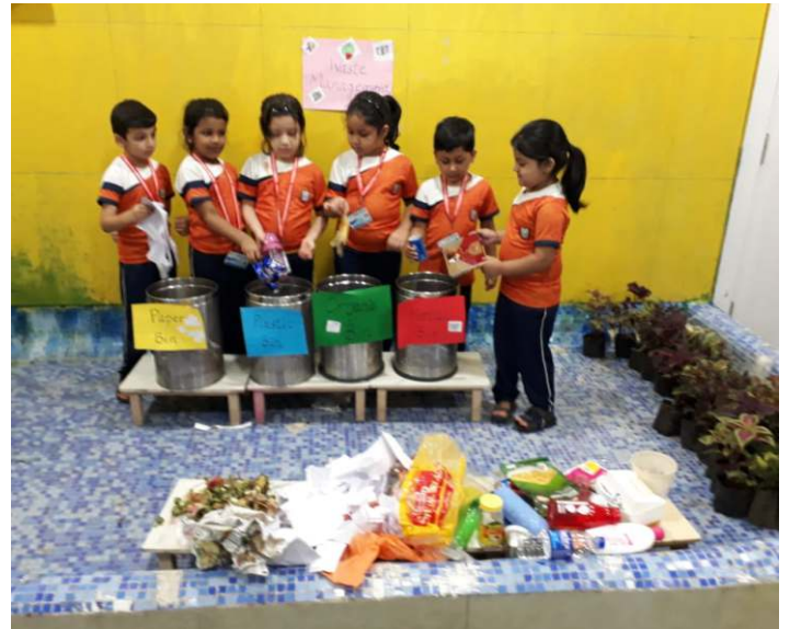
WE LEARNT TO SEGREGATE LITTER