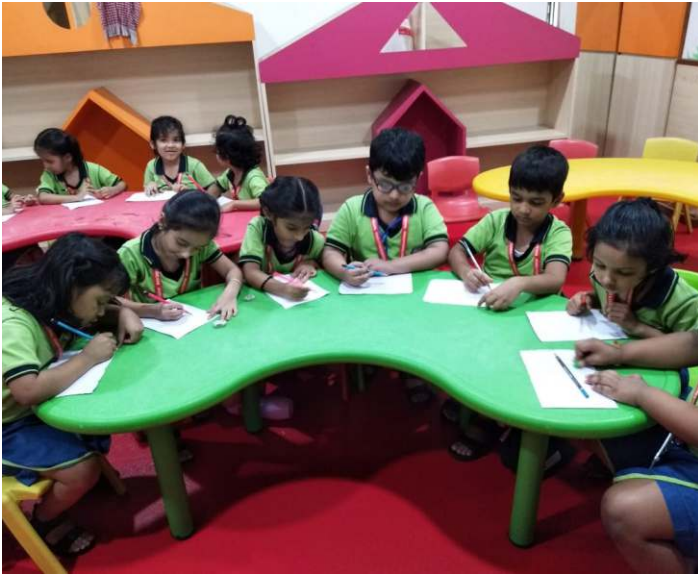
DEEP IN STUDIES