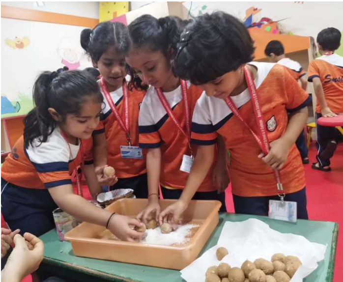
WE ARE MAKING LADDOO FOR GANPATI JI