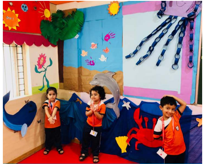
MY OCEAN FRIENDS