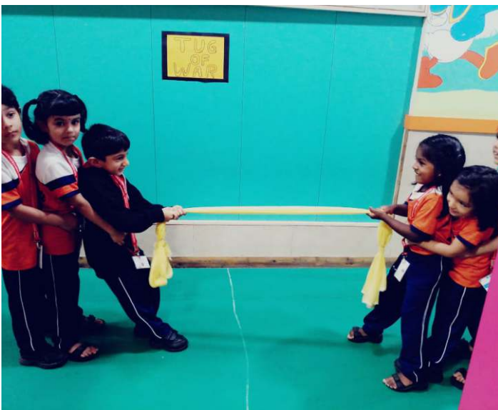
LET'S LEARN PUSH AND PULL