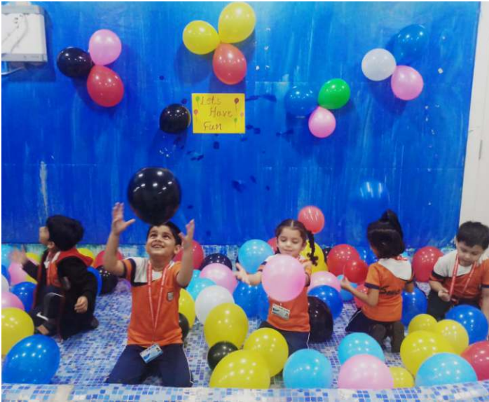
BALLOONS, BALLOONS EVERYWHERE