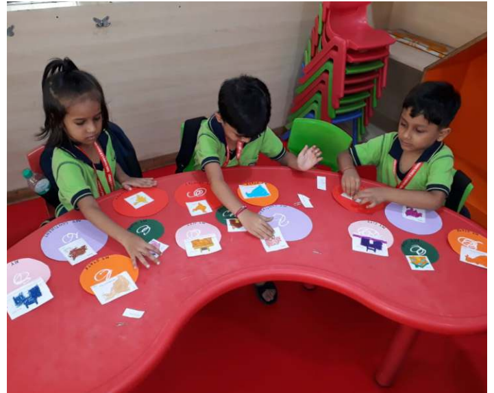
FLIP BOOK ON OUR EARTH IN MAKING