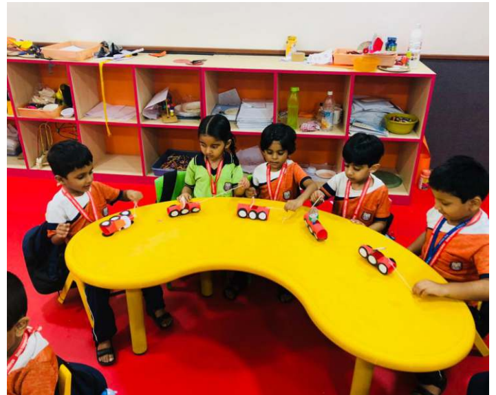
I MADE A TOY CAR