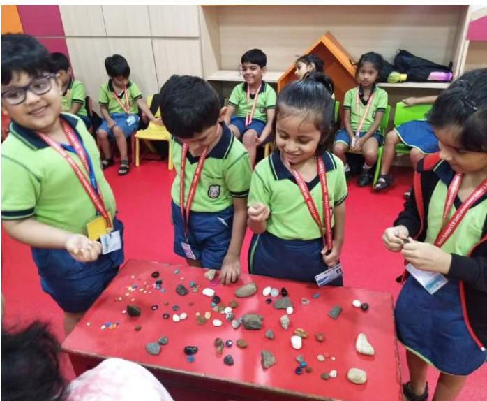
SO MANY PEBBLES, SO MANY TEXTURES