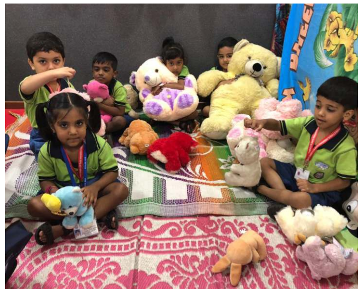
OUR FAVOURITE PLACE IN THE HOME ROOM