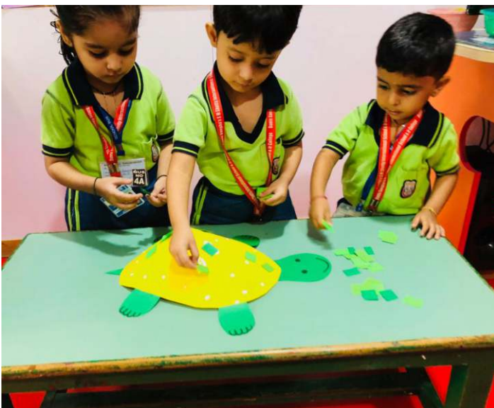
MY PET TURTLE