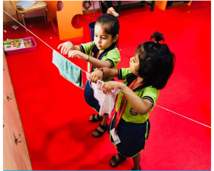
I WASHED MY HANKY TODAY