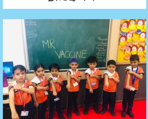
Brave little ones after MR vaccination