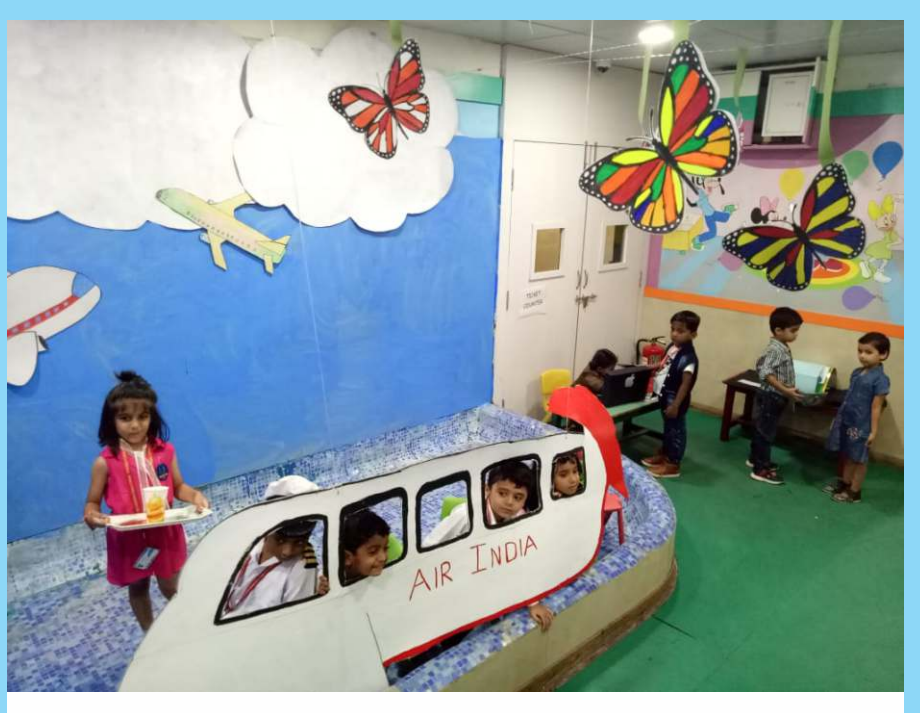
Boarding pass please